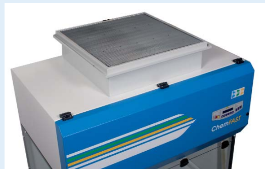
Additional filter housing re-circulating type